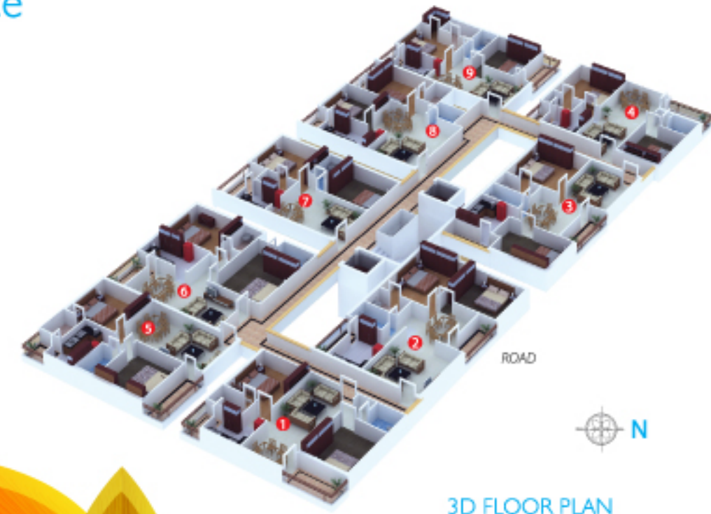
3D FLOOR PLAN

A great location does make life easier, as those who choose to reside at MAM's Classic Tower will quickly discover. From this quiet, central address, you and your family will enjoy uncomplicated access to commercial offices, international schools, fine restaurants, shopping areas. Whether for school, work or pleasure, living at MAM's Classic Tower will mean quicker trips and no more traffic jams. Our unique location also promises spectacular views as well as privacy since there are no other tall buildings in the immediate vicinity.